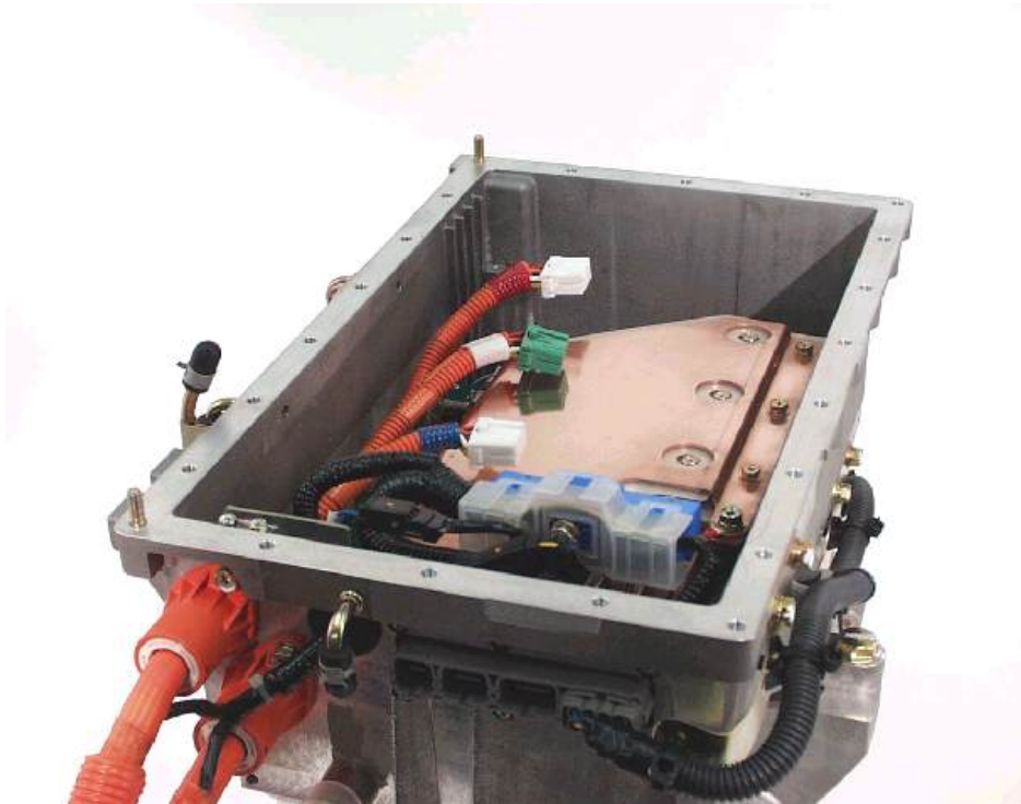
Top view of Inverter for Electric Vehicle

94. Inverters are installed by original equipment manufacturers (“OEMs”) in new cars as part of the automotive manufacturing process.