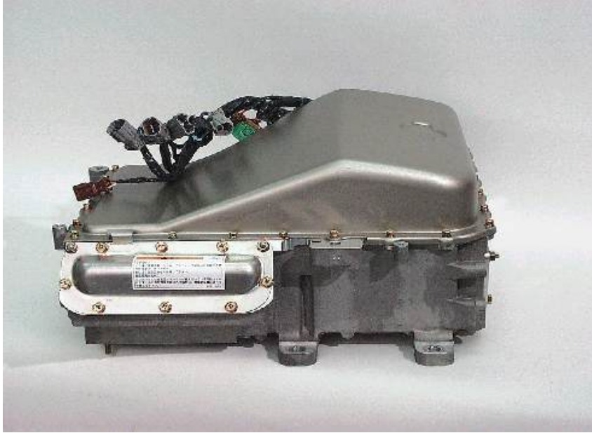
Electric Vehicle Inverter